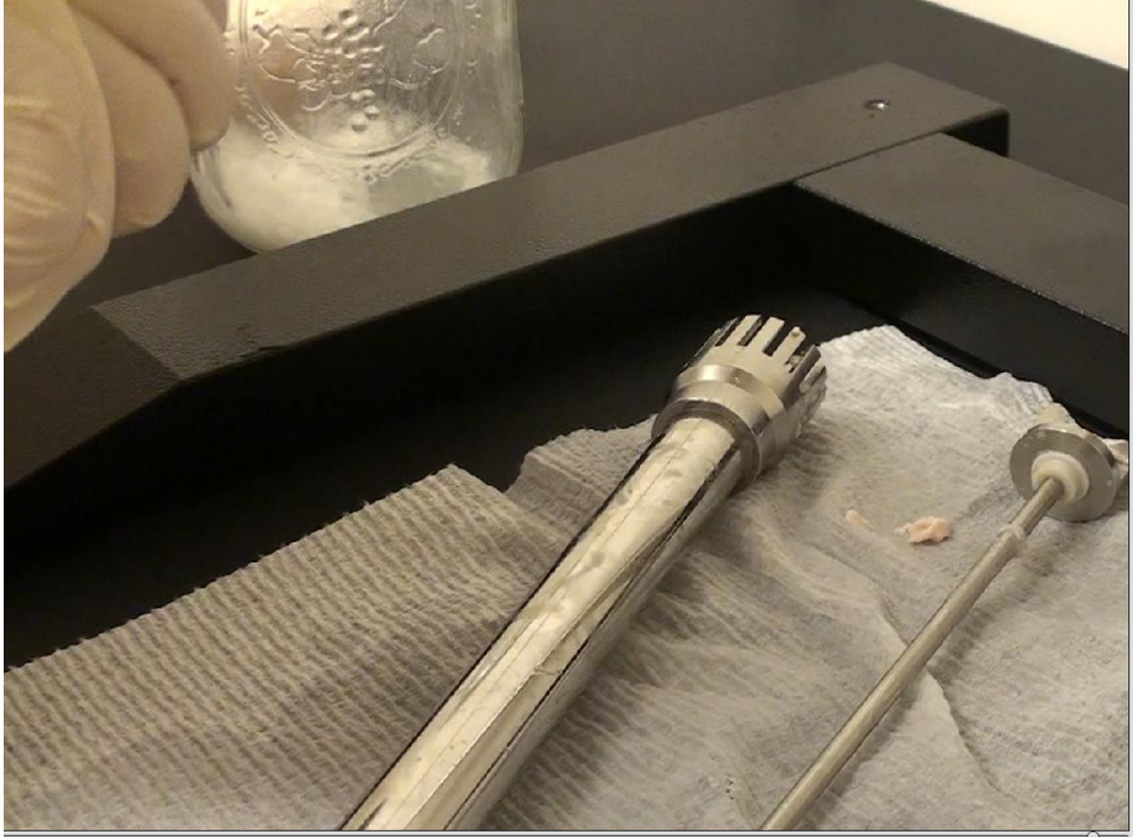
The generator is shown disassembled with the only remaining fibrous components left. Notice the significant decrease in size compared to large batch processing with a generator probe only.